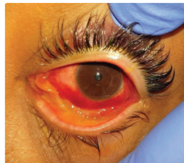
Figure 1: An adenovirus patient with epidemic keratoconjunctivitis and severe pseudomembrane formation indicated with fluorescein orange staining of the palpebral conjunctiva.

Purell Gel Hand Sanitizer is effective across the majority of adenoviral types typically associated with EKC. It should be noted that the insufficient decrease with type 8 was most likely due to its difficulty with viral culture and not the effectiveness of the hand sanitizer. While we demonstrate robust effectiveness of this ethyl-alcohol based solution, it is important to remember that previous