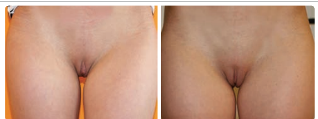
Figure 4: Before and 3 months post treatment with 6 ml of CaHA.