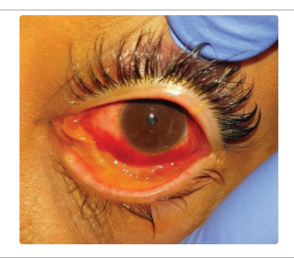
Figure 1: An adenovirus patient with epidemic keratoconjunctivitis and severe pseudomembrane formation indicated with fluorescein orange staining of the palpebral conjunctiva.

Purell Gel Hand Sanitizer is effective across the majority of adenoviral types typically associated with EKC. It should be noted that the insufficient decrease with type 8 was most likely due to its difficulty with viral culture and not the effectiveness of the hand sanitizer. While we demonstrate robust effectiveness of this ethylalcohol based solution, it is important to remember that previous