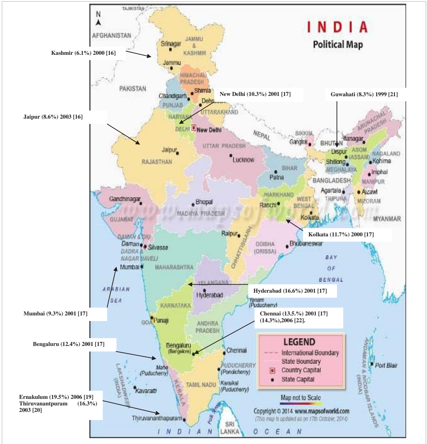
Figure 2: Recent trends of prevalence of type 2 diabetes mellitus in Indian population [26].